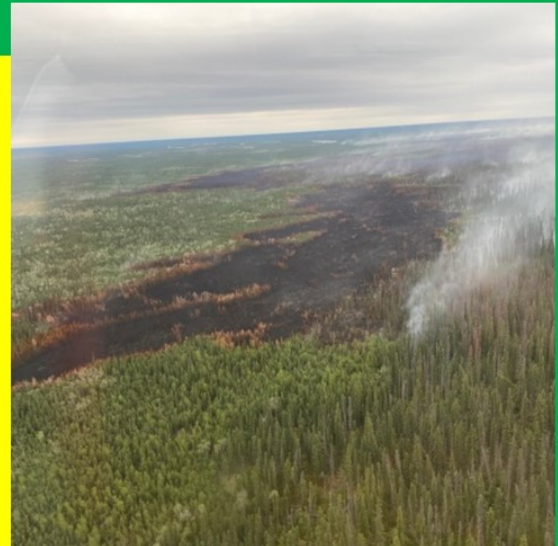
The Marten Creek Fire near Venetie at around 7 p.m. Saturday.